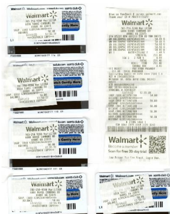
Wal-Mart Gift Cards

What is the Achievement, Integrity, Maturity (AIM) Program? The AIM program exclusively serves students (grades 7-12) who have been referred by the Hearings Office, School Board and individualized education program team. These students have been deemed a safety and security risk to other students and might otherwise have been unable to continue to work toward graduation.