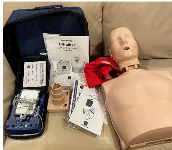
Training Equipment for AED Defibrillator and CPR Training